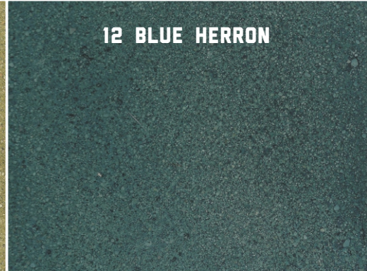
12 BLUE HERRON