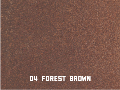
04 FOREST BROWN