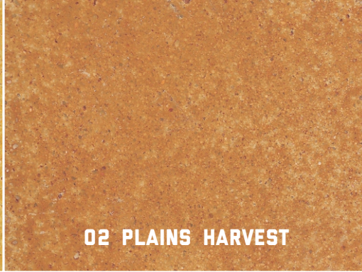
02 PLAINS HARVEST