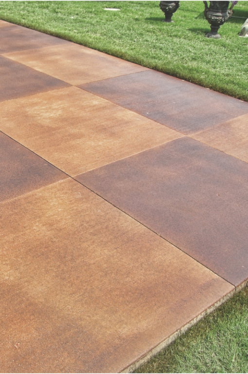
10 FRESH ACORN