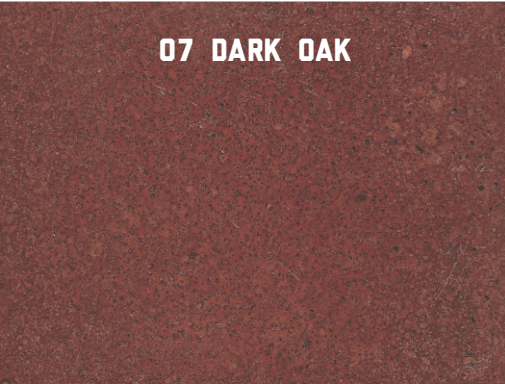
07 DARK OAK